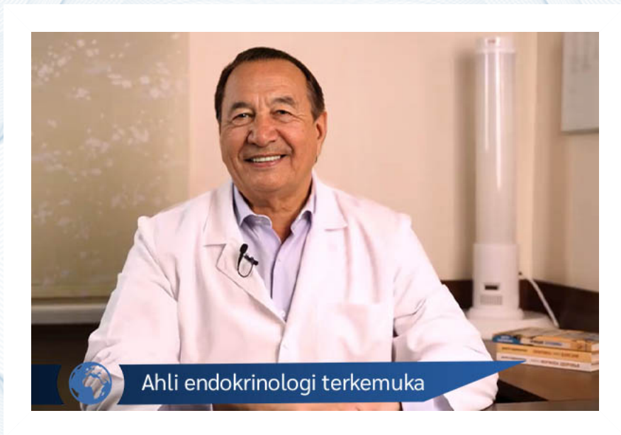
Ahli endokrinologi terkemuka